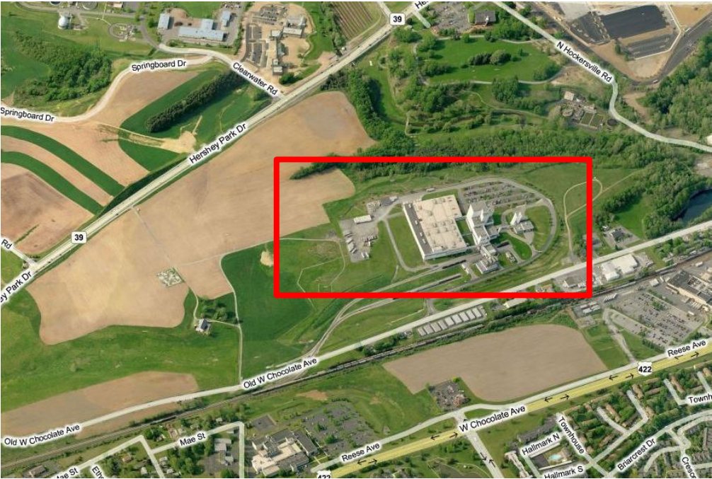
Figure 1 - Site Bird-Eye View

The Structural envelope of the facility was designed to be a precast concrete system except for the basement which was constructed using cast-in-place concrete. The mezzanine of the facility was erected using Hollow Structural Steel. Steel was chosen mainly since the MEP penetration would have to be known earlier when procuring the precast members; but since that was not possible, the structure was redesigned to steel since it does not require prior knowledge of the MEP penetrations.